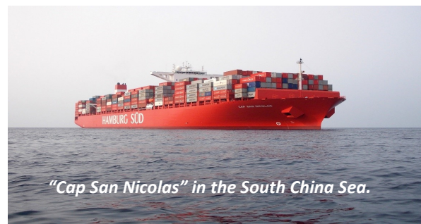
“Cap San Nicolas” in the South China Sea.

“Maersk Line expects to close the transaction by the end of 2017. Until then, Hamburg Süd and Maersk Line will continue business as usual as separate and independent companies”.